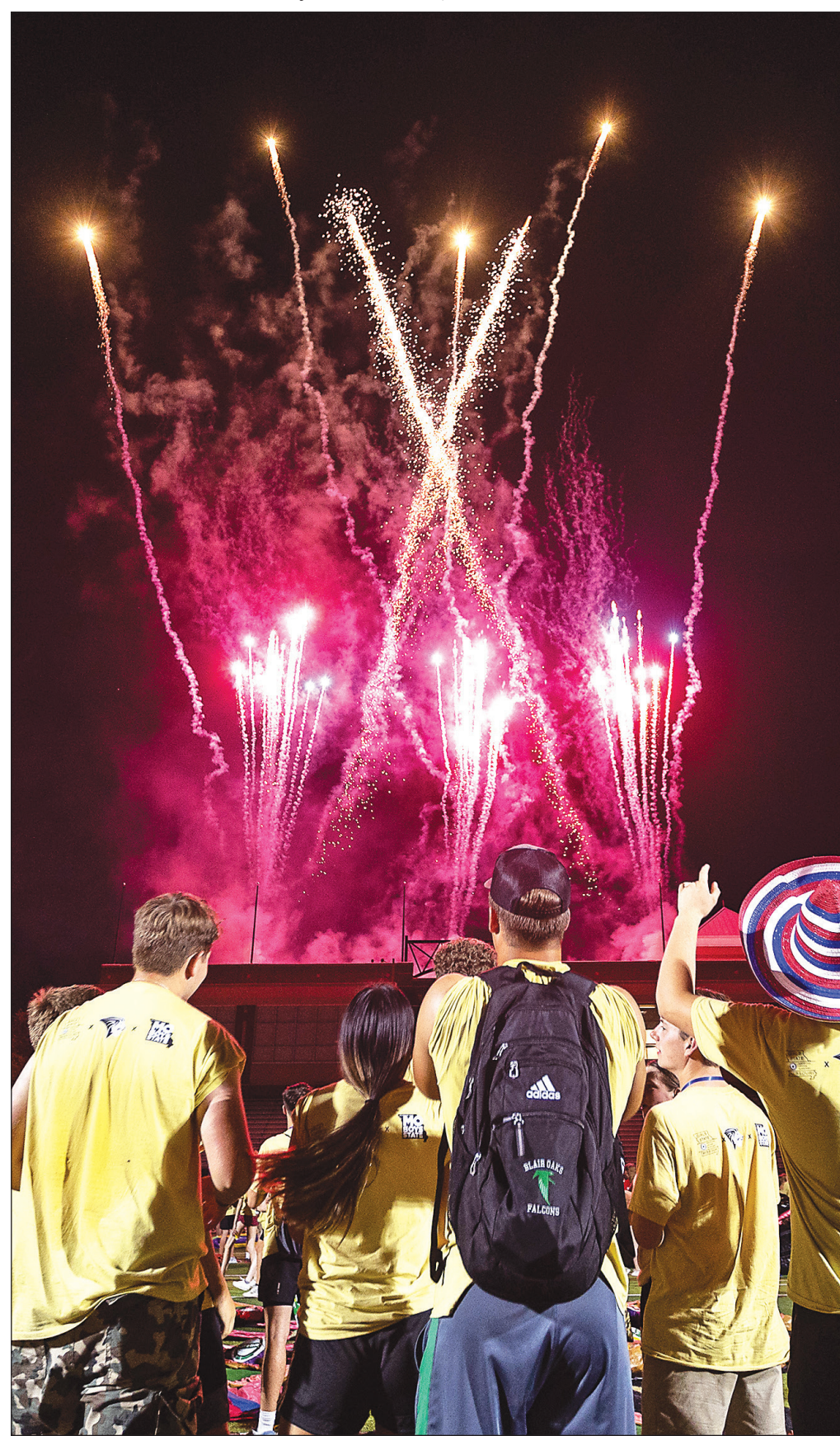
Fireworks light the sky during the State Fair at last year's Missouri Boys State/Missouri Girls State session. The MBS/MGS State Fair will take place Thursday night at Lindenwood University's Hunter Stadium.