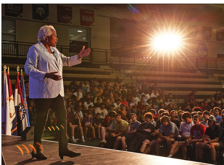
Donna Brazile addresses Missouri Boys State citizens during Sunday night's assembly at Hyland Arena. Brazile, a political strategist, served as the manager on Al Gore's 2000 presidential campaign.

Transitioning to the more material side, other voters mentioned that giving things away for free definitely helps sway their vote. Posters and just getting their name out there a lot was also mentioned as an important influence in voting decisions.